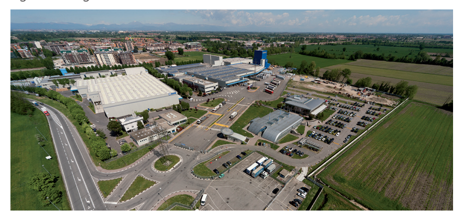
Figure 1: Mediglia Plant

& Ripara Zero and Planitop Rasa & Ripara R4 Zero. This analysis shall not support comparative assertions intended to be disclosed to the public.