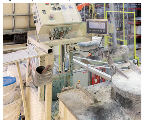
Figure 2: production process detail

The production process starts from raw materials, that are purchased from external and intercompany suppliers and stored in the plant. Bulk raw materials are stored in specific silos and added automatically in the production mixer, according to the formula of the product. Other raw materials, supplied in bags, big bags or tanks, are stored in the warehouse and added automatically or manually in the mixer. The production is a discontinuous process, in which all the components are mechanically mixed in batches. The semi-finished product is then packaged, put on wooden pallets and stored in the finished products warehouse. The quality of final products is controlled before the sale.