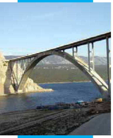
Bridge Krk – Krk Isle -Croatia