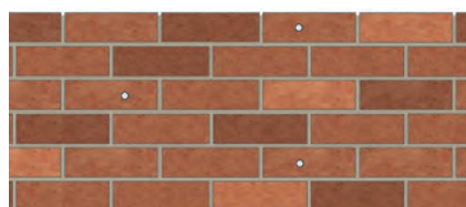
1. Install wall ties both sides of the intended vertical movement joint in a grid pattern