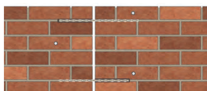
3. Inject resin or grout into the slot and insert the HeliBar/sleeve assembly