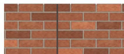
4. Make good the slots and wall ties holes. Seal the joint with a flexible mastic material