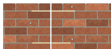
2. Cut horizontal slots in the mortar beds. Cut the vertical movement joint