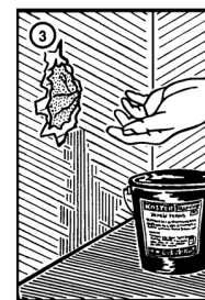
Leaks... ..Stopped... ..in seconds!

After stopping the active leaks, the area can be waterproofed. Mix as much KÖSTER KD 1 Base as can be applied within 10 minutes with water into a viscous, spreadable mass (slurry). Approximately 320 g of potable water is required per kilogram KÖSTER KD 1 Slurry. Apply the