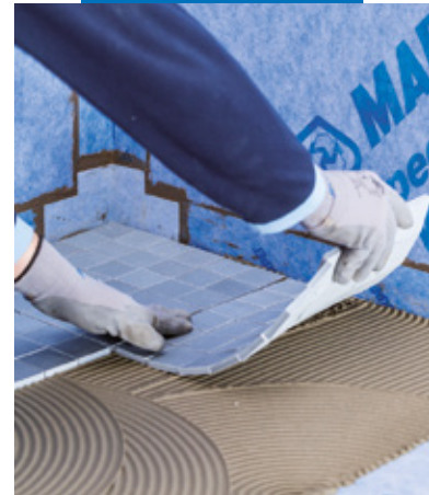
Laying of the tiles