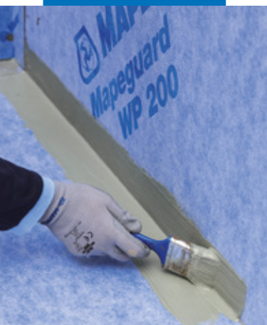
Application of the Mapeguard WP Adhesive in order to seal the joints in the corner before the application of Mapeguard ST