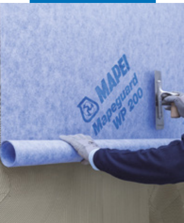
Laying Mapeguard WP 200