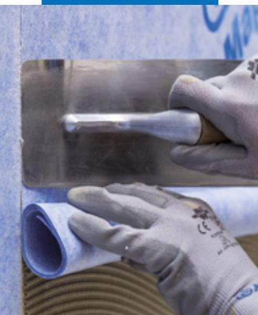
Application of the second sheet