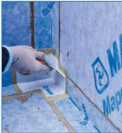
Application of MAPEGUARD IC in the internal corner with MAPEGUARD WP ADHESIVE