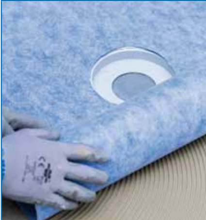
Unrolling MAPEGUARD WP 200