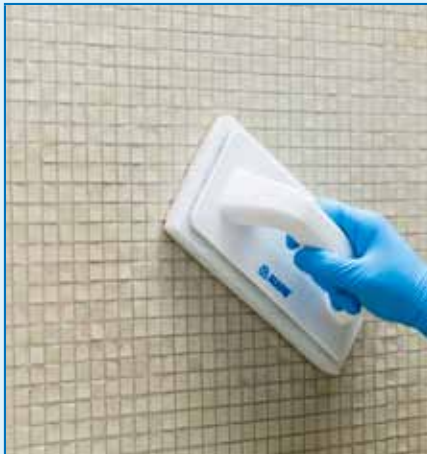
Cleaning off the glass mosaic with a damp Scotch-Brite® pad