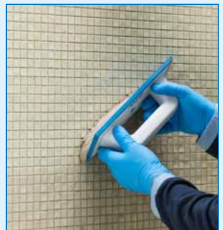
Grouting of the joints