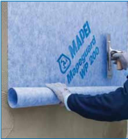
Laying the first sheet of MAPEGUARD WP 200