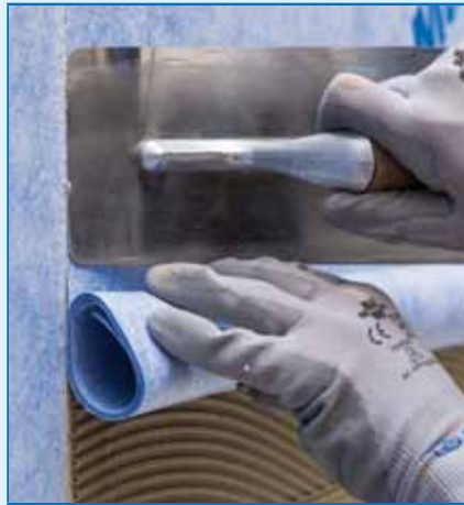
Application of the second sheet of MAPEGUARD WP 200