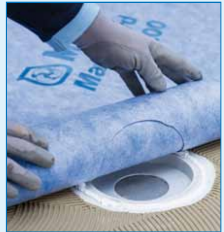
Laying of MAPEGUARD WP 200