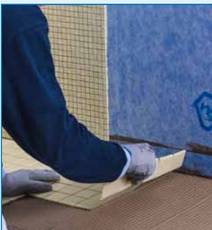
Tile installation with a cementitious tile adhesive