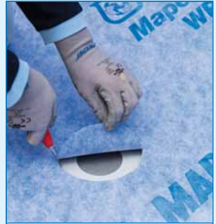
Cutting the membrane