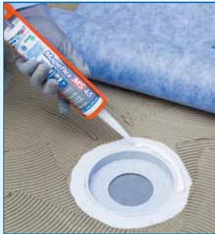
Application of MAPEFLEX MS 45 around the drain