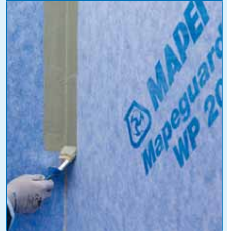
Application of MAPEGUARD WP ADHESIVE before MAPEGUARD ST to seal the junction between two adjoining sheets