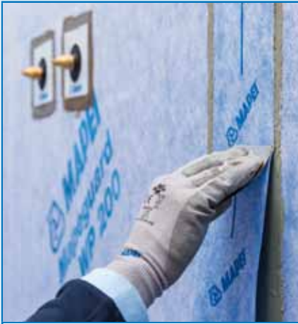
Application of MAPEGUARD ST