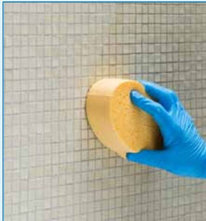
Cleaning and finishing the joints with a hard cellulose sponge