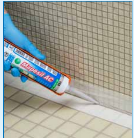
Application of the sealant in all corners