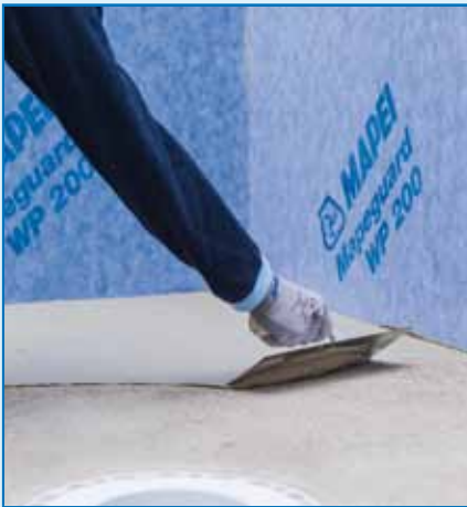
Application of the cementitious tile adhesive