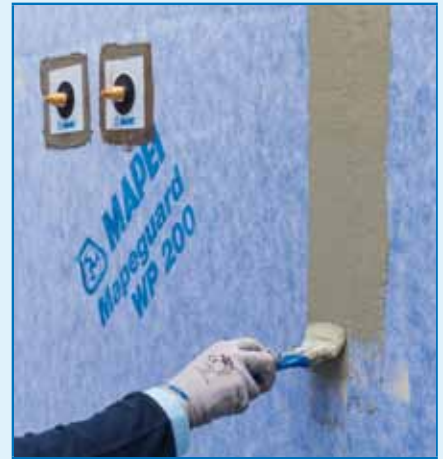
Application of MAPEGUARD WP ADHESIVE before MAPEGUARD ST to seal the junctions between two adjoining sheets