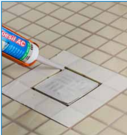
Application of the sealant around the drain