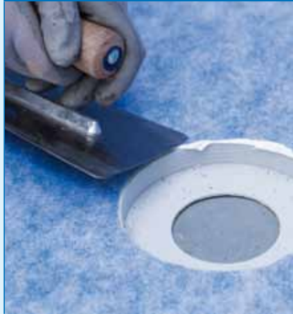
Press down MAPEGUARD WP 200 onto the drain