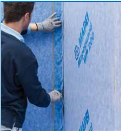
Application of MAPEGUARD ST onto MAPEGUARD WP ADHESIVE