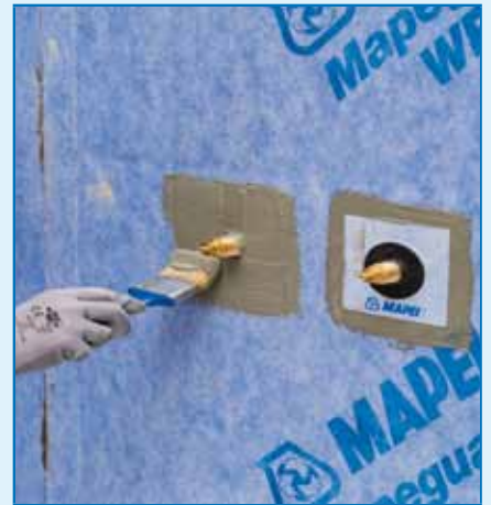
Application of MAPEGUARD PC with MAPEGUARD WP ADHESIVE