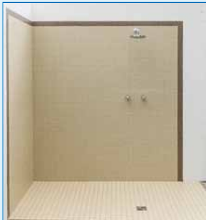
Bathroom completely tiled