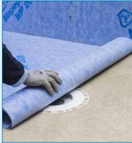
Preliminary positioning of the membrane in order to evaluate the drainage point