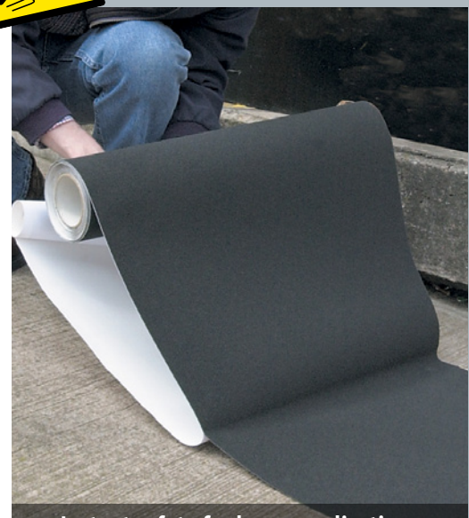
Instant safety for larger applications