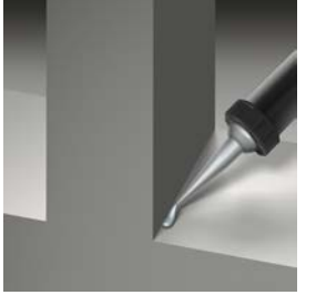
Figure 3: Apply a 10 mm diameter bead of SP525 to bottom corners of the window opening to match joint depth of tape