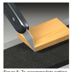
Figure 5: To accommodate setting blocks, notch out tape