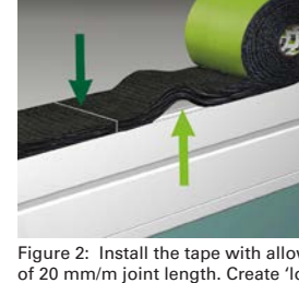
Figure 2: Install the tape with allowance of 20 mm/m joint length. Create 'loop' to ensure tight fit