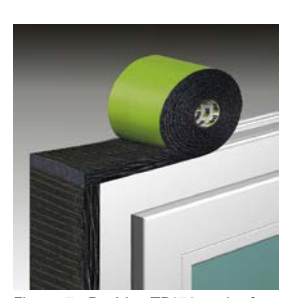
Figure 7: Position TP653 to the frame edge with the polymer film to inside. Make tight butt joint at the corners