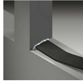
Figure 4: Apply the TP653, with self-adhesive face down and ends bedded in the SP525 beads