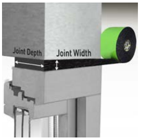
Figure 1: The joint width should be in the middle of the operational area. The opening and joint width tolerances

Safety data sheet must be read and understood before use.