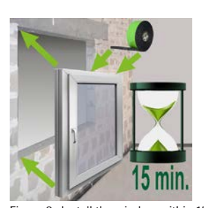
Figure 8: Install the window within 15