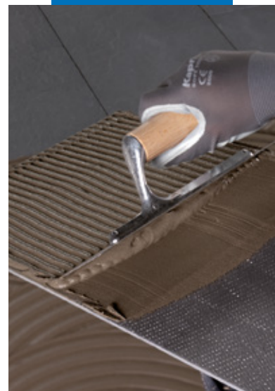
Spreading the adhesive on the back of the tile