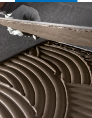
Installing thin porcelain tile on floor