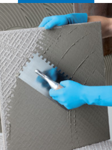
Spreading adhesive on the back of the tile