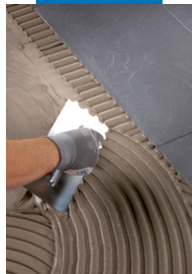
Spreading the adhesive on floor with a 9 mm round-tooth notched trowel