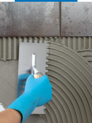
Spreading Ultralite S1 with a notched trowel on wall