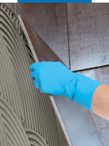
Laying large-sized tiles on walls

Ultralite S1 mix has a low viscosity, which makes it easier and quicker to apply. In spite of the above characteristics, the thixotropic nature of Ultralite S1 means there is no vertical slip when fixing on walls, even with large-sized tiles. Its excellent back-buttering capacity and thixotropic consistency make Ultralite S1 particularly suitable for laying thin porcelain tiles. In fact, the application of Ultralite S1 using the double-buttering technique on flat substrates ensures that there are absolutely no voids in the adhesive on the back of the tiles, thus avoiding the risk of fracture when subject to load.