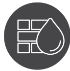
Damp Proof Membrane