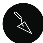
Damp Proof Course