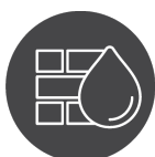
Damp Proof Membrane