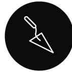
Damp Proof Course