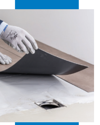
Application of LVT floorings with Ultrabond Eco MS 4 LVT in damp surroundings