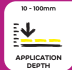
10 - 100mm APPLICATION DEPTH