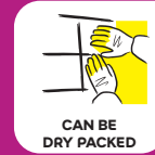
CAN BE DRY PACKED