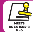
MEETS BS EN 1504-3 & -6