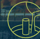
Grouts & Anchors