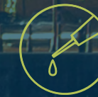
Joint Sealants & Adhesives