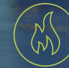
Passive Fire Protection