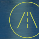
Highways & Urban Landscaping