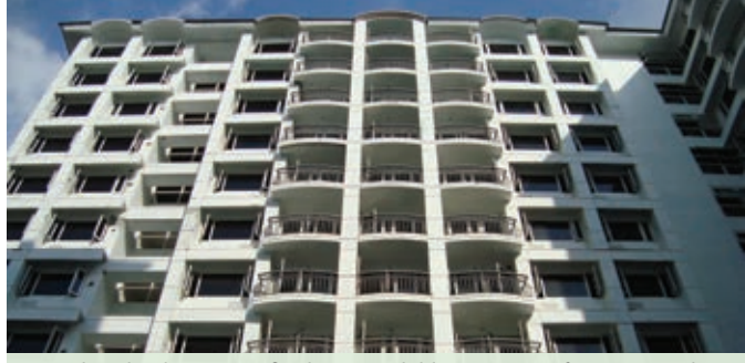
Monodex Ultra has a matt finish & is available in a range of attractive colours.

A technically advanced, minimal VOC, water-based decorative coating which protects against carbonation and water ingress without entrapping moisture. It is fast drying for year round use externally with excellent fire performance characteristics for internal use. Monodex Ultra prevents water ingress and resists the growth of mould and fungi, making it the ideal low cost coating for both new build and maintenance projects.