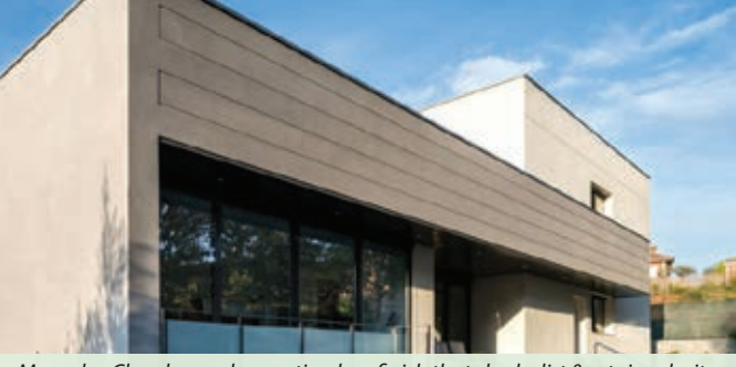
Monodex Clear has a clear, satin gloss finish that sheds dirt & retains clarity.

A transparent, elastomeric coating, ideal for maintaining the surface appearance of the concrete substrate, whilst still providing excellent anti-carbonation and weatherproof protection. Designed for application to external walls and facades, Monodex Clear is ideal for decorative concrete finishes, exposed aggregate panels, textured concrete, heritage applications, coloured concrete and other cementitious substrates.