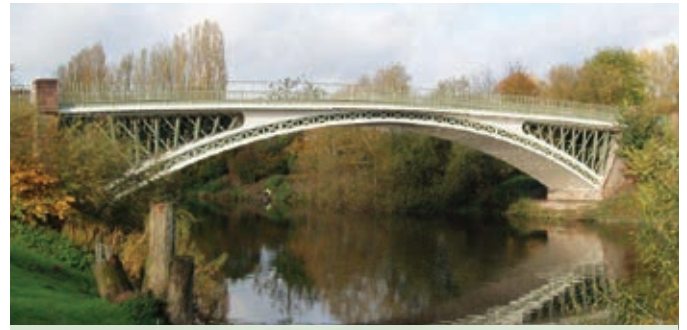
Monodex Smooth features advanced polymer resin for excellent adhesion.

A high performance water based, elastomeric, high build, decorative coating which provides protection against carbonation and water ingress, yet allows damp substrates to breathe. Monodex Smooth is ultra-fast drying which enables two coat applications to take place on the same day and facilitates year round usage. It resists the growth of mould and fungi and is ideal both for new construction and refurbishment projects.