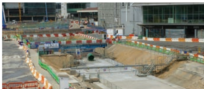
Flexcrete's water-based coatings for concrete decks are engineered to last.

Flexcrete's Cemprotec range of water based cementitious coatings can be applied to green concrete and are totally waterproof even under a 100m head of water. With unique epoxy and polymer technology, the Cemprotec E-Floor and E942 systems hydrate rapidly to form highly durable coatings with outstanding abrasion and chemical resistance that are designed to last the life of the structure.