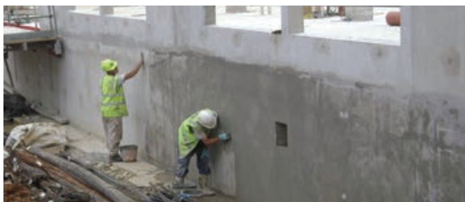
Monolevel FC colours can be blended to match the shade of concrete.

A fine, formed finish is achieved with Monolevel FC , applied using a simple bag-rubbing technique. Available in white and grey formulations, the shades can be blended to match the colour of the parent concrete, resulting in a uniform finish. If any areas need to be cut out, reinstatement can be easily achieved using Monomix , and minor surface defects can be filled using Monorub to give a super-fine finish.