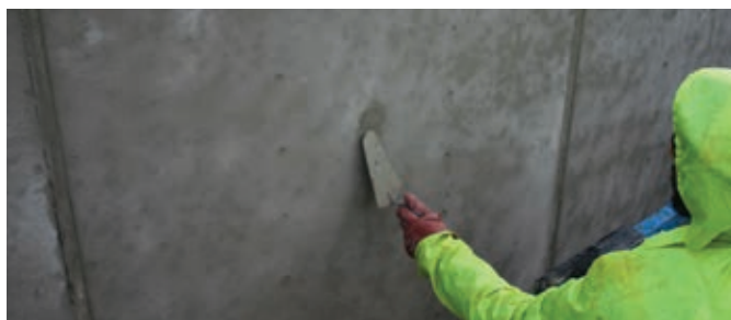
Tiefill is a rapid curing, polymer modified solution with high bond strength.

Voids can be filled with Tiefill , a rapid setting, non-shrink repair mortar. The product has WRAS Approval and is totally waterproof, enabling it to be used in water tanks, even those containing potable water. Tiefill can also be employed for sealing grout holes and voids around fixings in pre-cast elements. It is supplied as a single component system requiring only the addition of clean water to give a durable high strength mortar.