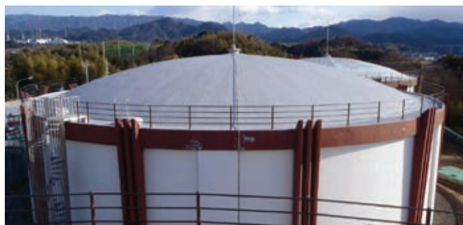
Roofdex HB is compatible with a wide range of flat, pitched & curved roofs.

Roofdex HB offers quick and effective application. It is easily applied by roller, brush or airless spray in a cold, fluid form to form a completely seamless, waterproof membrane. Exceptional UV resistance helps ensure that the product will provide outstanding protection for up to 20 years.