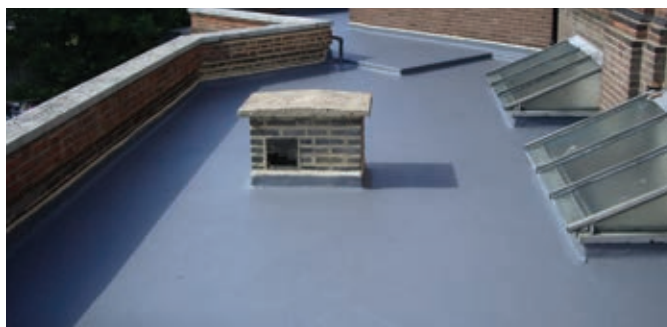
Roofdex HB is supplied in a single pack, meaning no complex mixing on site.

Roofdex HB contains state-of-the-art active biocide technology. Its active ingredients combat the growth of harmful bacteria and incorporate in-film protection, affording excellent resistance against algae and other biofilm attack.