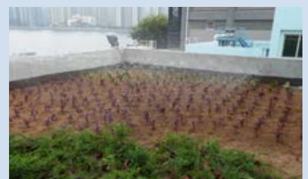
Typical green roof system, incorporating a Flexcrete waterproofing membrane.